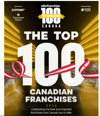
EF100 Annual Guide (Digital + Print)

Recognition within the EF100 provides independent validation of your franchise business and can help build trust with prospective franchisees, enhance recruitment and lead generation, strengthen investor and partner confidence, increase media visibility and industry awareness, and differentiate your brand in a competitive marketplace.