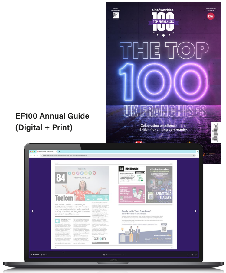
EF100 Annual Guide (Digital + Print)

Recognition within the EF100 provides independent validation of your franchise business and can help build trust with prospective franchisees, enhance recruitment and lead generation, strengthen investor and partner confidence, increase media visibility and industry awareness, and differentiate your brand in a competitive marketplace.